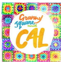
Sqaure 17 - @brightbag